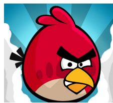
A rare avian species was sighted

This month an angry bird was sighted by the PLC of Troop 603. After laboring for days to catch the rare bird, the PLC brought them in so show the other boys.